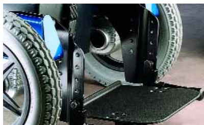
Up to 5" of height adjustability.